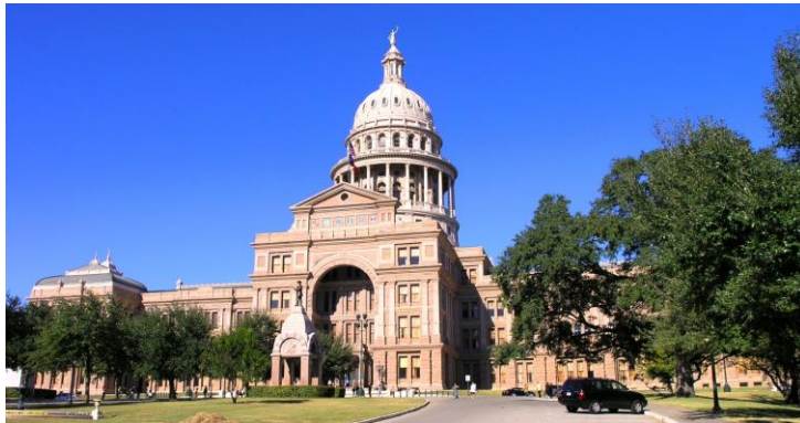
Texas Capitol Building, Austin