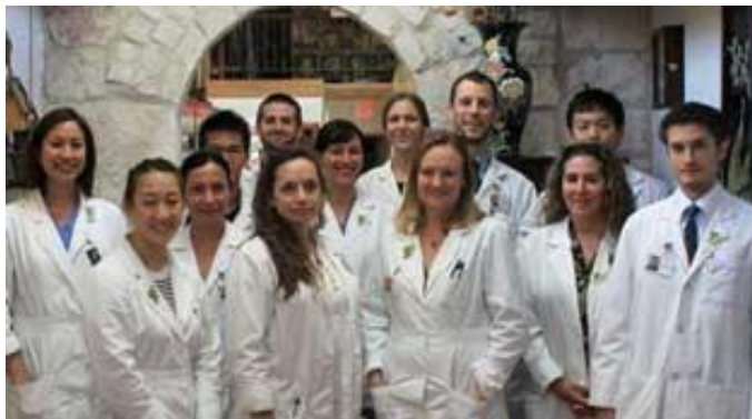
THSU Student Interns at the Student Clinic in Austin.

The clinic building is attached to the classroom building, an easy walk. There are five treatment rooms in the new clinic, and the herb dispensary contains herbal offerings in pill form, raw herbs, and granules. The facility offers our practitioner-instructors, interns and their patients a high-quality, modern internship facility for acupuncture and traditional Chinese Medicine.