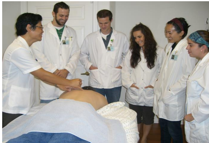
Demonstrating Needle Technique at THSU Austin

THSU reserves the right to make adjustments of 4-7% per year that reflect changes in the cost of living and education, subject to governing board approval. Federal financial aid is not available for students who are not seeking a degree. Completion of the Non-Degree Seeking Plan does not qualify students for certification or licensure in the practice of acupuncture. THSU does not issue I-20 forms for non-degree-seeking students.