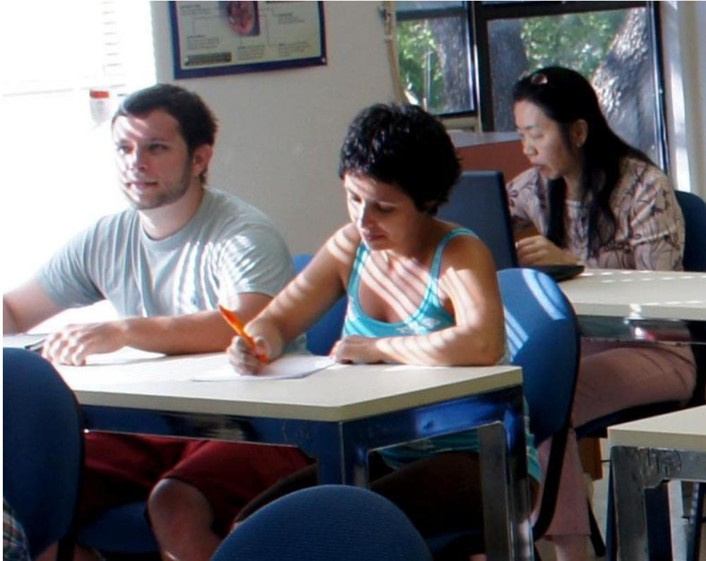
Students in Classroom 1, Austin Campus