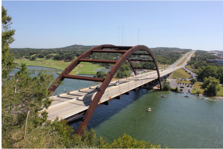
Penny Backer Bridge, Austin