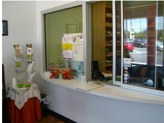
Student Clinic in San Antonio

Opportunity to earn Master of Acupuncture and Tui Na in China, along with the eligibility to receive a licensed endorsement to practice acupuncture in China. Federal Financial Aid not available for this option. For information on Dual Degree in Chinese Medicine and Business, see Master of Business Administration in Healthcare Management program.