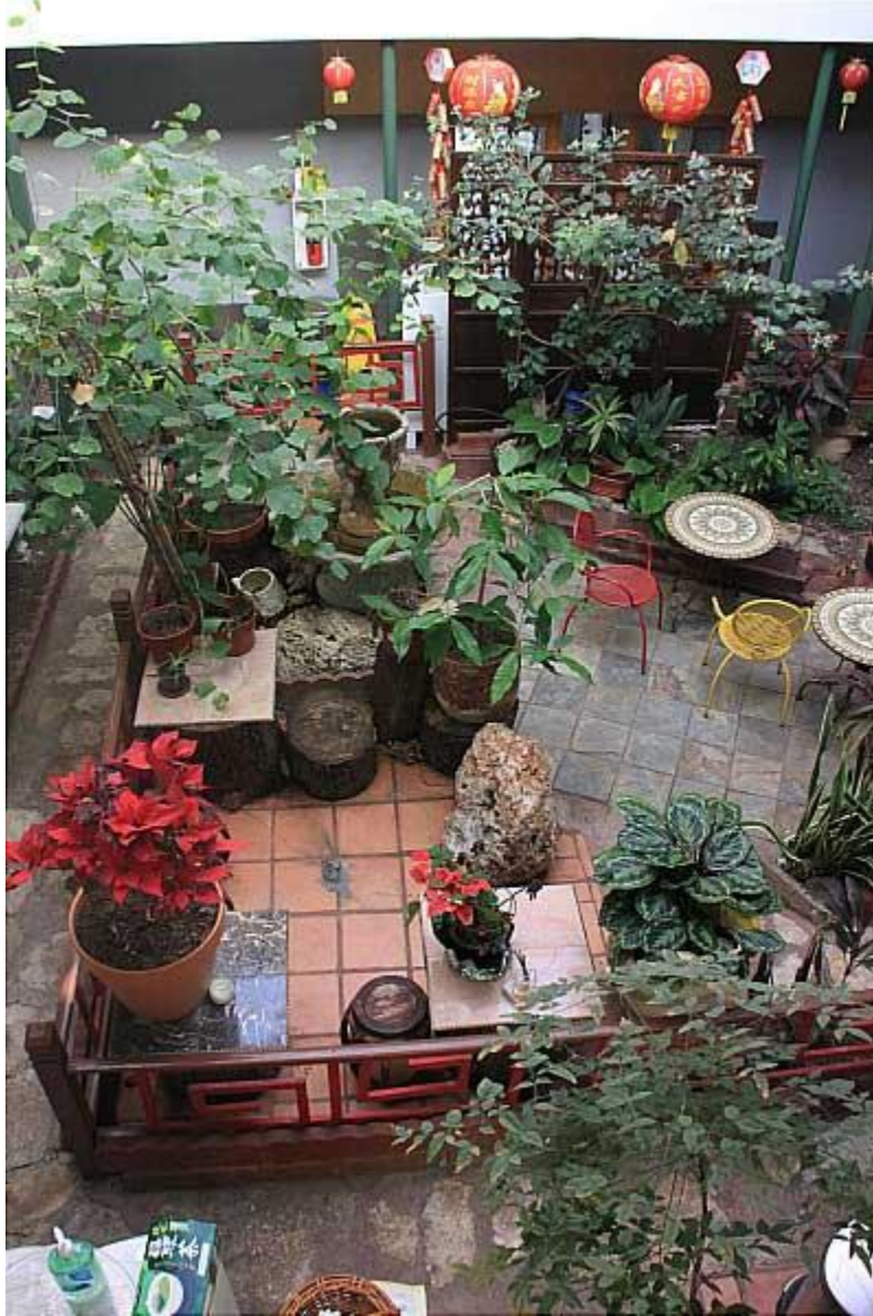
Courtyard at Classroom Building in Austin