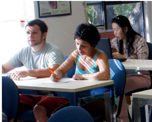
Students in Classroom, Austin Campus

(Three trimesters is the recommended schedule for this program of study. THSU reserves the right to make adjustments of 4-7% per year that reflect changes in the cost of living and education, subject to governing board approval.)