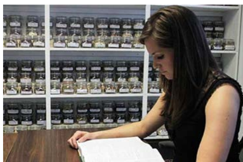
Studying in the Herb Lab, Austin