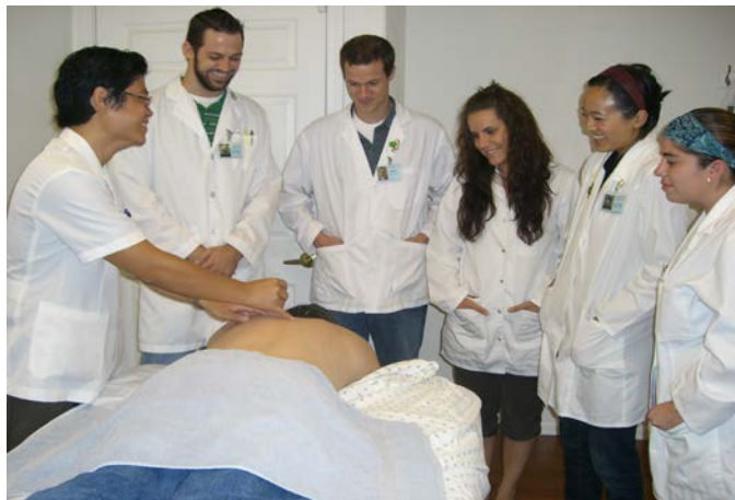
Demonstrating Needle Technique at THSU Austin

THSU reserves the right to make adjustments of 4-7% per year that reflect changes in the cost of living and education, subject to governing board approval. Federal financial aid is not available for students who are not seeking a degree. Completion of the Non-Degree Seeking Plan does not qualify students for certification or licensure in the practice of acupuncture. THSU does not issue I-20 forms for non-degree-seeking students.