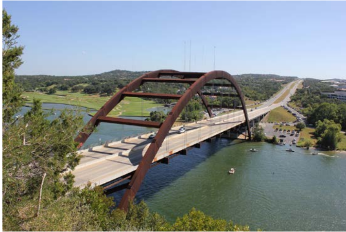
Penny Backer Bridge, Austin