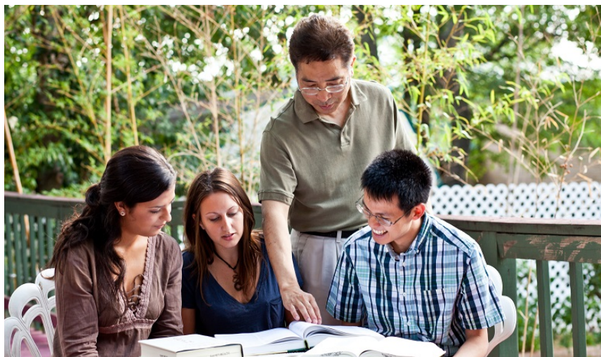
Studying at the Austin Campus