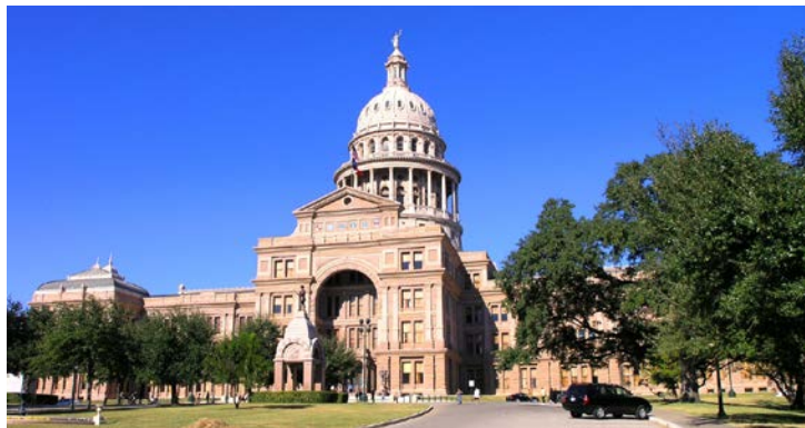
Texas Capitol Building, Austin