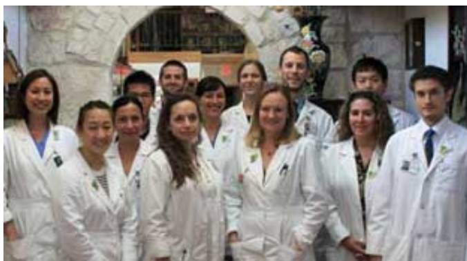
THSU Student Interns at the Student Clinic in Austin.

The clinic building is attached to the classroom building, an easy walk. There are five treatment rooms in the new clinic, and the herb dispensary contains herbal offerings in pill form, raw herbs, and granules. The facility offers our practitioner-instructors, interns and their patients a high-quality, modern internship facility for acupuncture and traditional Chinese Medicine.