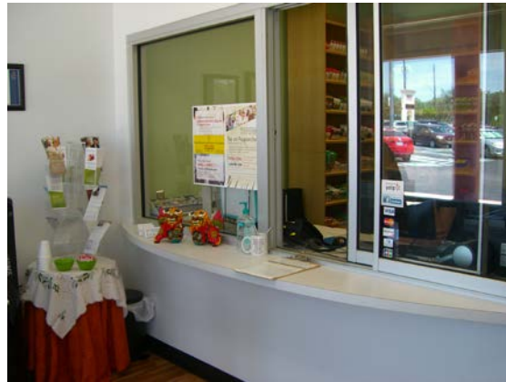
Student Clinic in San Antonio

Opportunity to earn Master of Acupuncture and Tui Na in China, along with the eligibility to receive a licensed endorsement to practice acupuncture in China. Federal Financial Aid not available for this option. For information on Dual Degree in Chinese Medicine and Business, see Master of Business Administration in Healthcare Management program.